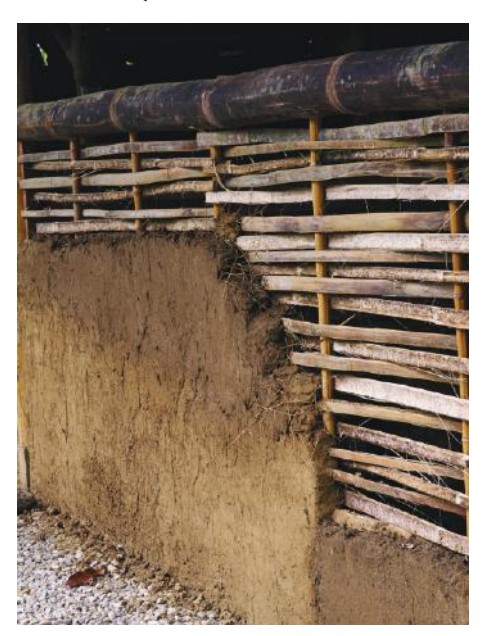
Figure 1. Sustainable building structure utilizing dried bamboo strips and adobe.

This project involved extensive knowledge transfer including teaching contributions to the community on the farm and hands on learning outcomes of living and working on the farm. My contributions involved teaching and demonstrations on: soil chemistry and compost testing; renewable energy conversion technologies; and materials for next generation electronics (2-D van der Waals materials