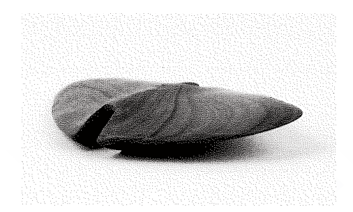
Double Notched Butterfly Banners tone 5000 BC, Logan Museum Collection Beloit, Wisconsin