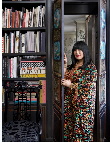
Anna Sui at home