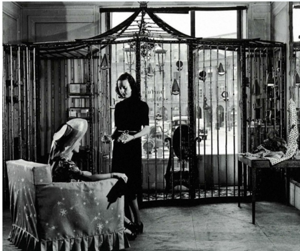
Birdcage in the Schiaparelli perfume boutique, Paris, ca. 1937, by Jean Michel Frank.

After World War II, the collaboration between fashion designers and leading interior decorators continued, particularly in New York City. Two Park Avenue apartments—one for Hattie Carnegie by the exclusive French firm Jansen and the other by American’s legendary decorator Billy Baldwin for Mollie Parnis—exemplify this phenomenon. Later, in London during the swinging 1960s, Mary Quant commissioned Terence Conran to design her boutique called Bazaar.