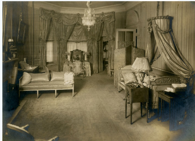
Rose Room of the Lucile Couture House in New York City, circa 1916.

Examples such as Coco Chanel’s sumptuous Paris pied-à-terre and Anna Sui’s whimsical New York apartment validate the belief that few disciplines exemplify the gracious art of living better than fashion and interior decoration. The creation of interiors that promote social progress—from workers’ rights to urban renewal—have been likewise advanced by female fashion creators such as Madeleine Vionnet to Tracy Reese. It is no surprise that interiors commissioned and created by female fashion designers continue to have profound influence, widespread appeal, and enduring relevance.