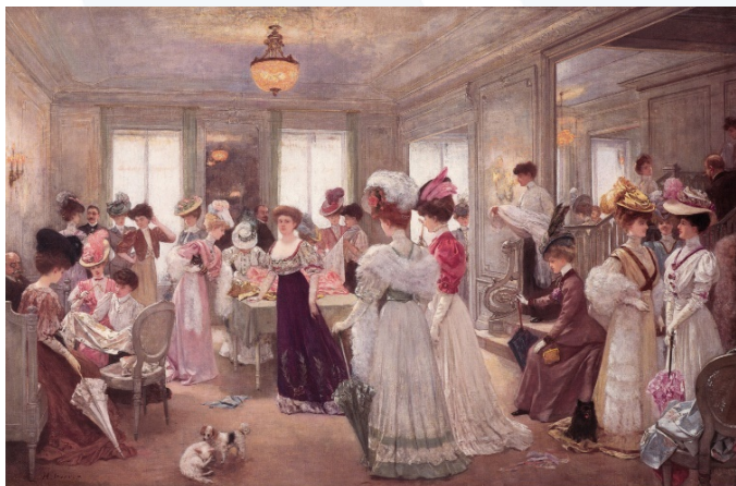
Cinq Heures chez Paquin (Five Hours at Paquin) by Henri Gervex, 1906.