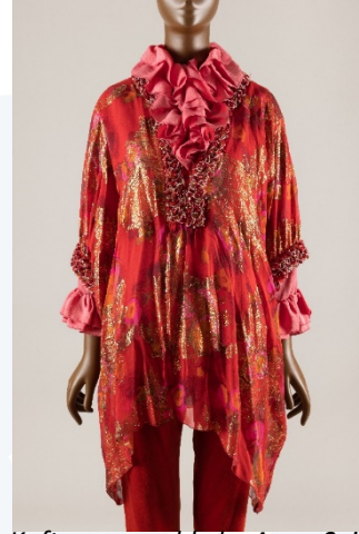
Kaftan ensemble by Anna Sui, autumn 2012. Gift of Anna Sui.