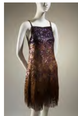
Yves Saint Laurent Tunic and shorts ensemble 1969 France Silk organza, sequins, beads Gift of Lauren Bacall