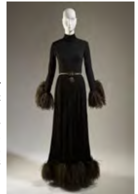
Christian Dior Evening dress and belt 1968 France Silk jersey, ostrich feathers, metal, silk organza, sequins, beads Gift of Lauren Bacall

Rhythm leads the eye from one part of a design to another part, creating movement through repetition of pattern or color.