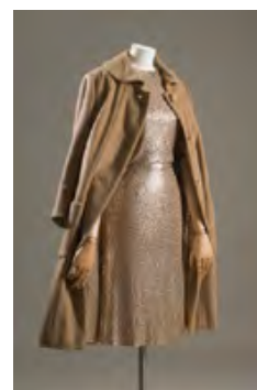
Traina-Norell Dress and coat ensemble c. 1956 USA Camel cashmere, silk jersey, sequins Gift of Lauren Bacall