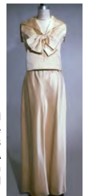
Norman Norell Pantsuit ensemble c. 1968 USA Silk satin Gift of Lauren Bacall