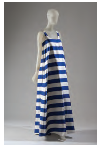
Jil Sander (Raf Simons), dress, spring/summer 2011, Germany.

The line between fashions we consider minimal or those we think of as maximal can