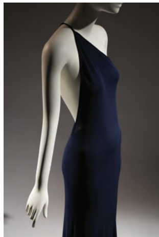
Calvin Klein, evening dress, 1996, USA.

Sir Issac Newton's third law of motion states that for every action, there is an equal and opposite reaction. Similarly, every fashion movement is a response to what came before it, perpetuating a design cycle that alternates between exuberant and restrained. Sartorial expression ranges from minimalist to maximalist, with some designers identifying almost exclusively with one aesthetic over the other. Calvin Klein, for instance, was known for fashion minimalism, while Christian Lacroix was famous for his elaborate maximalist fashions.