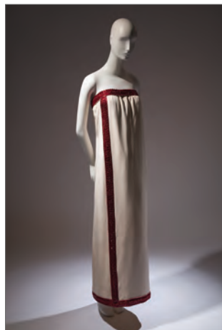
YSL, evening dress, fall/winter 1965-66, France.