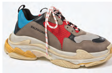
Balenciaga, Triple S Sneaker, 2018, France.

be quite fine. Inspired by the grandeur of the couture, Raf Simons's spring 2011 collection for Jil Sander explored the boundaries between minimalism and maximalism. “It almost challenged me to the opposite, to do the idea of maximalism,” he admitted to Women's Wear Daily .