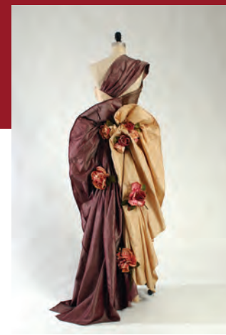
Hardy Amies, evening dress, circa 1948, England.