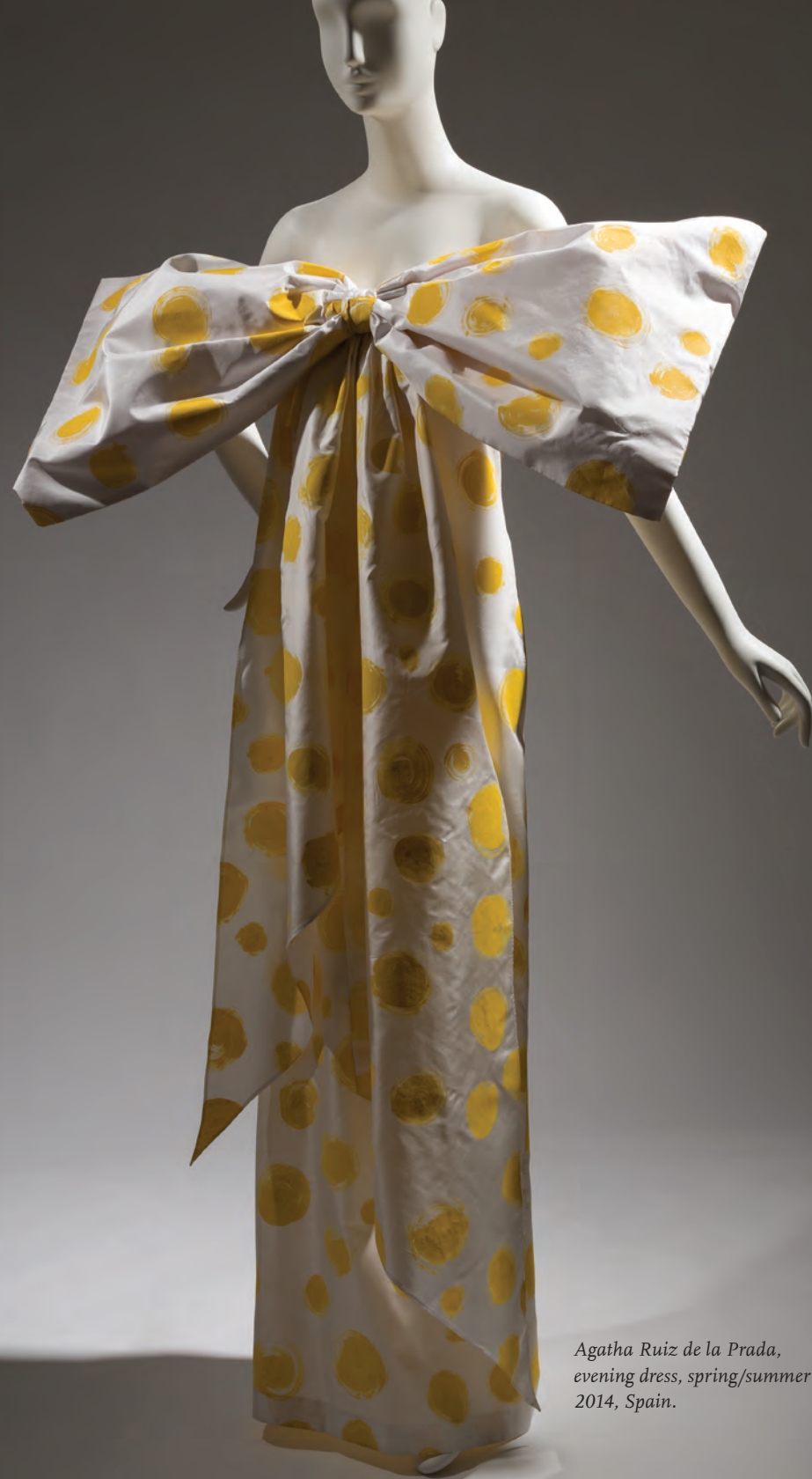
Agatha Ruiz de la Prada, evening dress, spring/summer 2014, Spain.